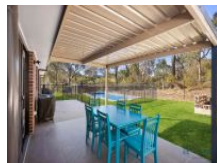
Tahmoor 14 Blue Gum Place

Great family home in a sought after location on 998m2 Properties of this nature in a prime location are highly sought after.This Tahmoor property provides.. Darren Smith 02 4677 1488