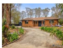
Bargo 21 Marshall Avenue