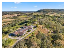
Menangle 285 Carrolls Road

Sunnyside Elevated with Views on 25 Acres Welcome to Sunnyside Entertainers dream home with grace and charm on 25 rural acresExciting opportunity to purchase a six-bedroom home on a grand scale.. Gerard Smith 02 4677 1488 Darren Smith 02 4677 1488