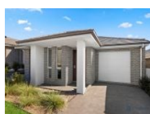
Wilton 9 Spearing Street