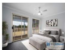
Picton 5 Whitfield Place

Great Family Home on 885m2 Welcome to your perfect family home in a desirable location of 5 Whitfield Place, Picton. This spacious 4-bedroom home offers an exceptional lifestyle.. Darren Smith 02 4677 1488