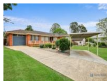
Tahmoor 28 Tahmoor Road

Ideal Family Home On 1309m2 Welcome to this charming residence located in a popular street with quality homes surrounding. Set on a generous 1309sqm block on the high side of the.. Gerard Smith 02 4677 1488 Paul Vella 02 4677 1488