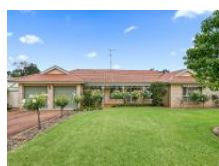
Thirlmere 8 Madigan Grove