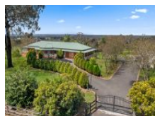
Bargo 315 Arina Road

Commanding home on 8.64 acres We are excited to present this exceptional rural property to the market place. The home is in a unique location elevated with breathtaking views to the.. Gerard Smith 02 4677 1488 Paul Vella 02 4677 1488