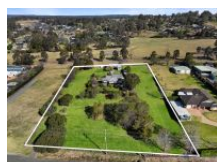
Tahmoor 20-22 Remembrance Drive

Development Opportunity on 5334m2 Get ready to inspect this property that has been held in one family for over 88 years. The property has a wide frontage and great main road exposure being..