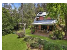
Lakesland 490 Rockbarton Road

Retreat in Sydney Greater Region PRICED TO SELL!! The owners are motivated and will consider all serious offers. We are proud to offer this exclusive rural property, located in the heart..