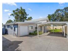
Thirlmere 18A Turner Street