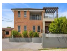
Villawood 14 Bent Street

House & Granny Flat on 600m2 This residence nestled in a quiet setting of Villawood offers two dwellings on a 600m2 parcel of land. The House and granny flat duo is an ideal choice..