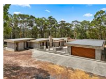
Wilton 2 Jakes Way

Morning Wings- Custom Built Paradise on 28 Acres Welcome to 2 Jakes Way, Wilton - A magnificent custom-built home that offers an exceptional living experience in a tranquil location at the end of a cul-de-sac..