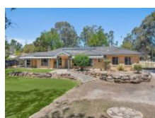
Douglas Park 70 Hopson Street