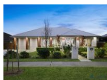
Wilton 9 Doneley Street