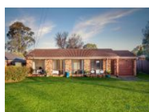
Bargo 71 Hambridge Road