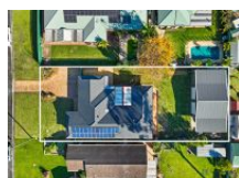
Wilton 28 Peel Street

A Family Entertainer & Tradesmen Shed on 1,017m2 THIS MOTIVATED VENDOR HAS REDUCED TO SELLWe are proud to offer this very exciting opportunity to purchase a beautiful home in a quiet leafy street in the..