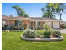
Elderslie 17 Southdown Road

Family Entertainer On 738m2 Be sure to inspect this impressive family home positioned on a superb 738m2 block of land in sought after Elderslie. Conveniently located to schools, parks,.. Trevor Ive 02 4677 1488 Paul Vella 02 4677 1488