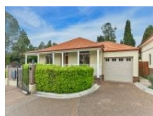
Picton 1/253-255 Argyle Street

Stylish, Low Maintenance Living Located in a boutique development of 8 villas is this stunning architecturally designed 2 bedroom residence, perfect for those looking to downsize or invest.Positioned.. Trevor Ive 02 4677 1488