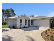
Bargo 6A Nooral Street

The Perfect Family Home on 638m2 Nestled in the popular township of Bargo, this immaculate as new 4-bedroom home offers a delightful blend of modern living and a low maintenance lifestyle.. Trevor Ive 02 4677 1488