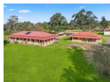
Thirlmere 46 Shelleys Lane

Dual Living on 5 Acres Sensational offering to the market! A superb rural holding, suitable for various pursuits, but ideally catered to those looking for dual accommodation,.. Trevor Ive 02 4677 1488