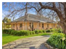
Balmoral 580 Wilson Drive

Country Charm & Character on 5.38 acres Welcome to your dream property! This magnificent country style master-built home exudes timeless appeal, character, and class, nestled on a picturesque..