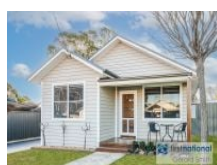
Bargo 6 Nooral Street

Beautifully Renovated 3-Bedroom Home on 482m2 Welcome to this beautifully renovated 3-bedroom home which is a testament to the impeccable taste and attention to detail of the current owners. Situated.. Trevor Ive 02 4677 1488