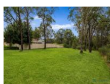
Wilton 22 Campsie Street

Build Your Dream Home on 1175m2 Ready to build your dream home? This is a great opportunity to secure a prime 1175m2 block of land in sought after Wilton. Registered and ready for you.. Trevor Ive 02 4677 1488