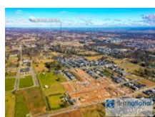
Austral Lot 208, 60-80 Eighth Ave

Prime Block of Land on 343m2 - Registration Expected Mid to Late September This is an exciting new block of land fresh to the marketplace. The level block with allow you to build..