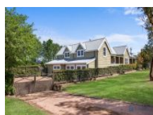
Picton 18 Antill Street

Historic Weatherboard Home on 1044m2 A piece of history is on display having faultless presentation with quality craftsmanship and finishes.It is with great privilege we present this elegantly..