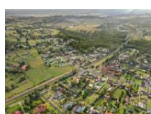
Douglas Park Lot 3, 40 Station Street