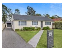
Douglas Park 19 Trentham Avenue