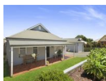
Menangle 12 Riversford Close

Where Modern Elegance Meets Rural Tranquility Welcome to 12 Riversford Close, Menangle, NSW 2568Where modern elegance meets rural tranquility. This stunning property boasts a plethora of features that.. Paul Vella 02 4677 1488