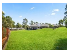
Thirlmere 30A Turner Street

Country Style Home in town on 688m2 Style charm and character are on display in the sale of the unique brand new home located in an established part of Thirlmere only minutes walk into the..