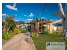
Tahmoor 32 Thirlmere Way

Ideal Investment in Town Centre on 1,012m2 Discover the perfect family home in the desirable location of 32 Thirlmere Way, Tahmoor. The spacious and modern 4-bedroom residence offers an exceptional.. Gerard Smith 02 4677 1488