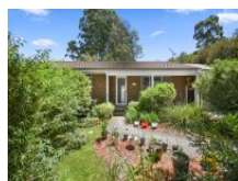
Picton 25 Campbell Street