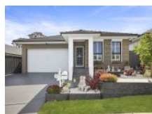
Elderslie 17 Gracie Road

Stylish Family Haven on 495m2!! This immaculately presented 4-bedroom home sits on 495m2 in the popular suburb of Elderslie. Close to schools and Camden golf course as well as being..