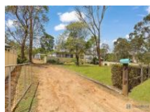
Yanderra 10 Mortimer Street

Huge Potential on 2144m2 This is the one you have been waiting for located in a quite leafy street in the Yanderra village.The home is original with a partial renovation. The property..