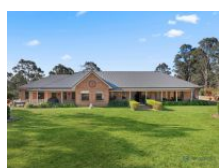
Wilton 60 Wilton Road