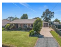
Bargo 59 Radnor Road