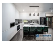
Thirlmere 28 Mason Street