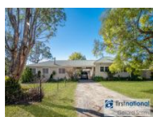
Yanderra 30 Chandos Road

Great Investment Opportunity On 9 Acres The owner is motivated to sell and will meet the market.All genuine offers will be considered.Be quick to inspect this superb 9 acre block of land with.. Mike Wiltshire 02 4677 1488