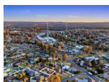
Tahmoor 7/46 Struan Street

Trevor Ive 02 4677 1488 Paul Vella 02 4677 1488