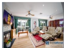
Wilton 1 Swaine Drive