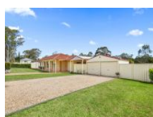
Bargo 42 Avon Dam Road

Great Family Home on 1034m2 Situating just minutes from the freeway this immaculate family home is a must to view. The warm and inviting home is neat as a pin and move-in ready.The..