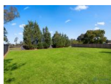
Tahmoor 12A Remembrance Drive

Build Your Dream Home On 700m2 If you have been searching for the perfect blank canvas to build your dream home, this registered vacant block of land in Tahmoor offers an exceptional.. Trevor Ive 02 4677 1488