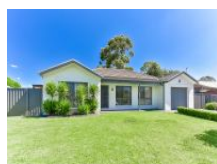
Tahmoor 42 Park Street

Low Maintenance Living on 488m2 This is a great opportunity to purchase a quality 4 bedroom home conveniently located close to Tahmoor train station, shops and local school. Whether you.. Trevor Ive 02 4677 1488