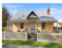
Thirlmere 391 Thirlmere Way

Charming Cottage on 499.4m2 This charming property is a perfect image of a character cottage, boasting beauty and delightful street appeal. The interior spaces have been thoughtfully..