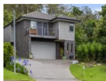
Picton 301A Argyle Street

Nestled In The Picturesque Town of Picton Nestled in the picturesque town of Picton, where the beauty of tree-lined streets meets a spectacular semi-rural backdrop, 301A Argyle Street invites you.. Paul Vella 02 4677 1488