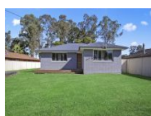
Tahmoor 13 Courtland Avenue

Renovated Home with Granny Flat Approval on 978m2 Conveniently located within walking distance to shops, school and train station this recently renovated home is a great starting point for a young family,.. Trevor Ive 02 4677 1488