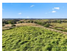
Menangle 265 Carrolls Road

25 Rural Acres- Elevated with Views Exciting Opportunity to Purchase quality large acreage in the Menangle Township. The property is located at the end of Carrolls Road being a quite no through.. Gerard Smith 02 4677 1488 Darren Smith 02 4677 1488