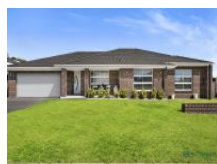
The Oaks 6 Emmaline Avenue

Immaculate Family Home in a Tranquil Location - By Private Inspection Only Welcome to 6 Emmaline Avenue. Situated in a peaceful suburb of The Oaks, this property offers the perfect..