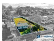
Bargo 34 Railside Avenue