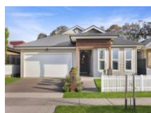
Wilton 24 Charlton Street

Charming Custom Built Home - Your Dream Property Awaits! Positioned in an exclusive estate where you can perfectly connect with the surroundings. With its beautiful..