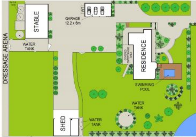
PARTIAL SITE PLAN (NOT TO SCALE)