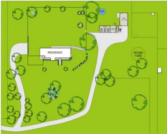
PARTIAL SITE PLAN (NOT TO SCALE)