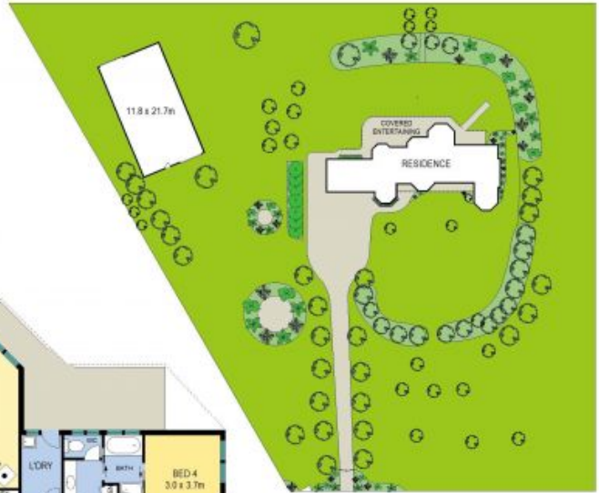
PARTIAL SITE PLAN (NOT TO SCALE)