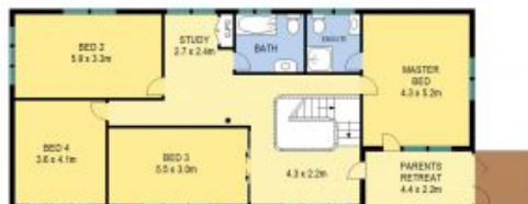
MAIN RESIDENCE UPPER LEVEL