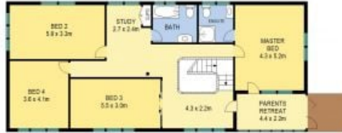
MAIN RESIDENCE UPPER LEVEL