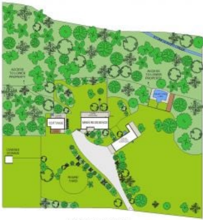
PARTIAL SITE PLAN (NOT TO SCALE)