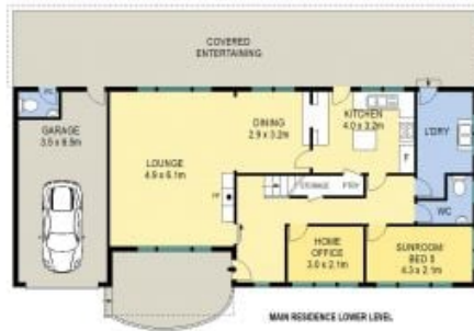
MAIN RESIDENCE LOWER LEVEL