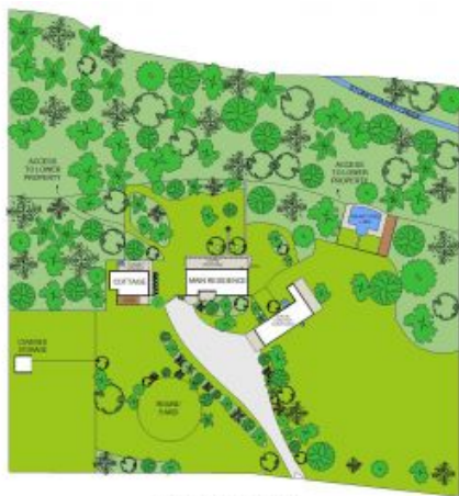
PARTIAL SITE PLAN (NOT TO SCALE)