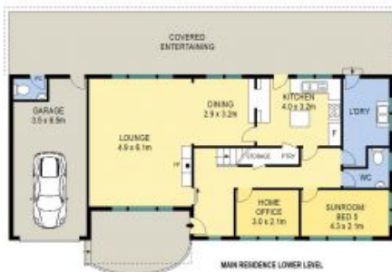
MAIN RESIDENCE LOWER LEVEL