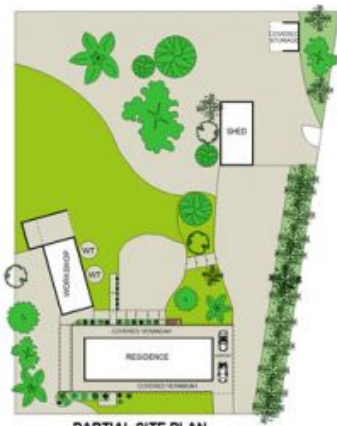
PARTIAL SITE PLAN